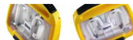
110V - 16A