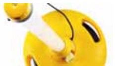
110V - 16A